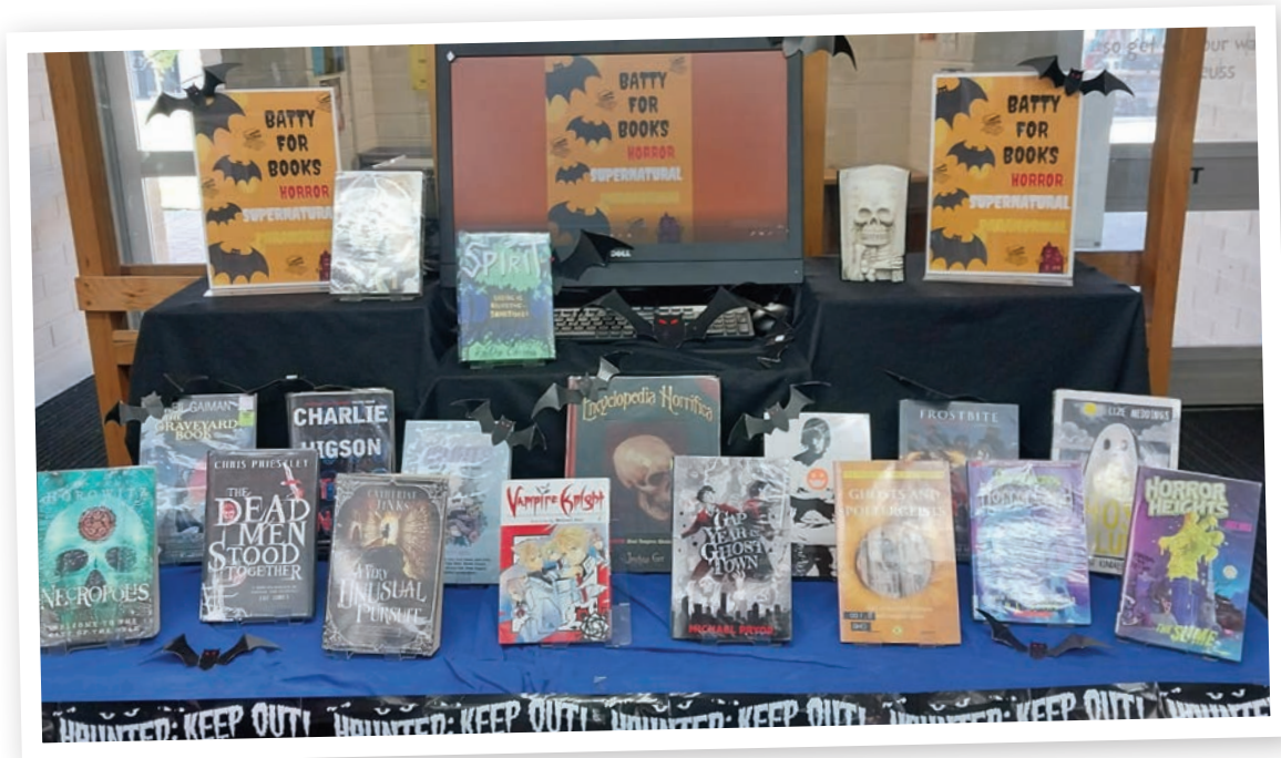
Week 3 Library Display – Batty For Books

Please ask your student/s to check at home, as well as their lockers and bags, to locate and return all items borrowed by their relevant due date. Thank you.