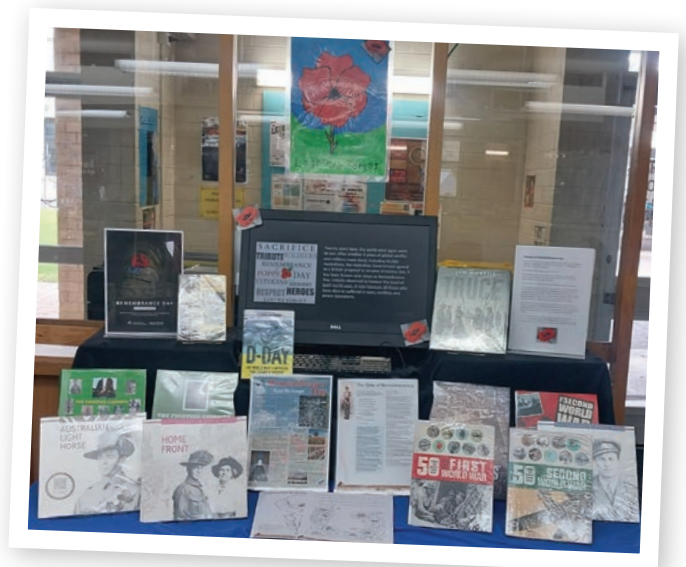
Library November Display – Lest We Forget